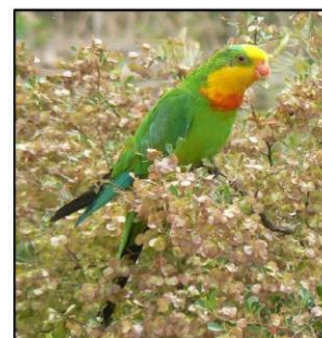
Superb parrot feeding on hop bush seed.