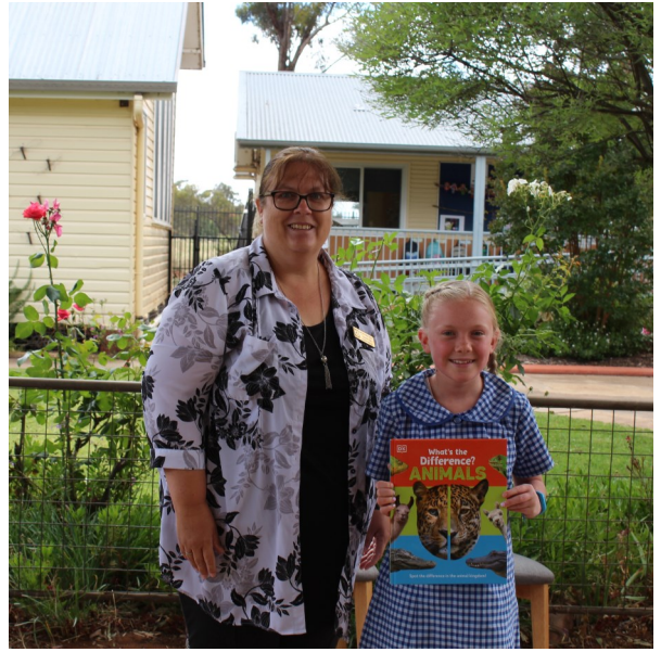
Stage 2 Application to Learning Award (Ganmain Men's Shed)